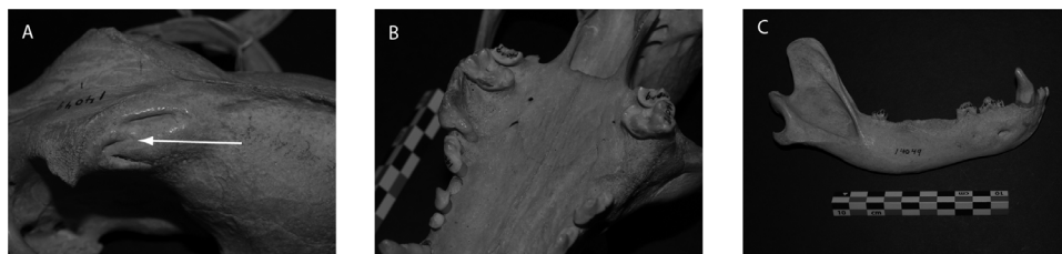
Figure 3. Photographs of a dog crania and mandible collected during the Robert E. Peary expedition in Northwest Greenland in 1897 (specimen #14049, AMNH). A. Healed depression fracture in the left frontal just posterior to the orbit. B. Antemortem loss of the right 4 th premolar and antemortem fracture of the left 4 th premolar. C. Right mandible with 4 th premolar, first molar (carnassial), and 3 rd molar lost antemortem. The antemortem tooth loss and fracture observed in this specimen is consistent with intentional tooth removal to inhibit gnawing. doi:10.1371/journal.pone.0099746.g003

evidence for such practices and behaviors for most of our samples. The Ellesmere dogs were tethered with chains when not pulling sleds, a practice required by law in the 1960s. The percentage of Ellesmere dogs with bite wounds however is similar to that seen in wolves living in this same general region (Table 6). Bogoras [44] mentions that during travel in winter, sled dogs were tethered overnight, but it is not stated whether they were similarly secured during the day. Further, it is unclear which communities he was speaking about, or precisely where he collected the dogs we sampled. Our Chukotka dog sample had some of the lowest rates of bite wounds in the study (Table 6). Overall, no simple correlations between tethering practices and the frequency of bite wounds can be asserted.